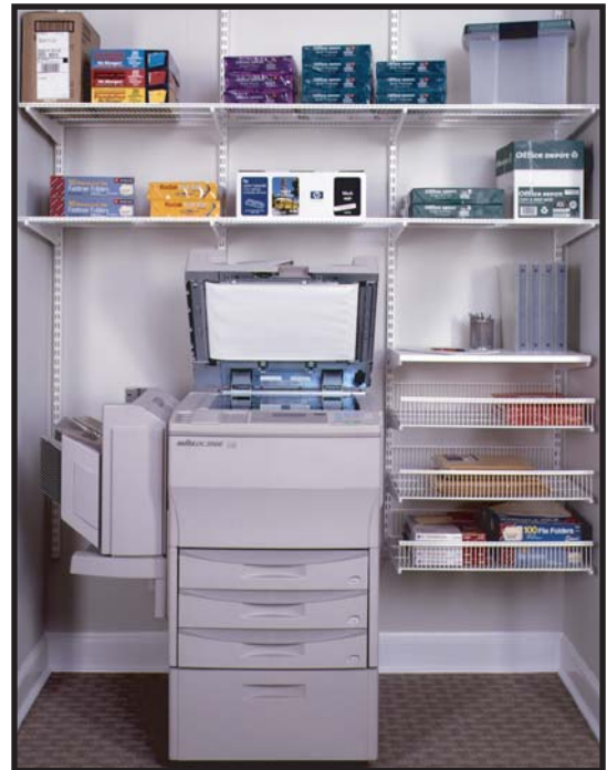
elfa® COPY SOLUTION

The elfa® track and standard 'backbone' shelving system provides the ultimate in flexibility and function . A typical storage room can increase capacity by 200% , simply by planning storage from the ceiling down .