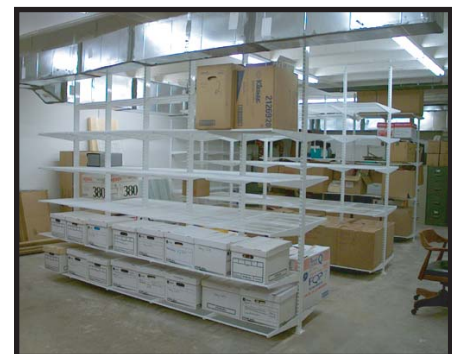
FLOOR TO CEILING elfa®