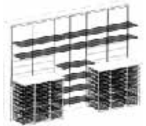
Resource library in architecture firm