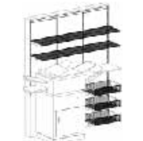
Copier supply storage