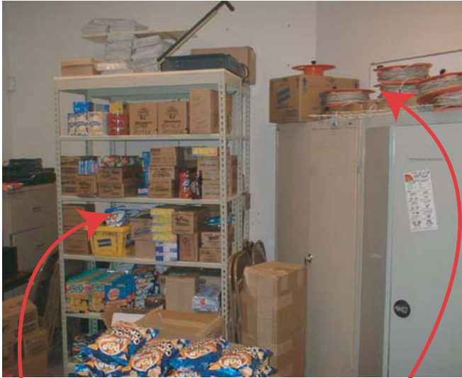
Temptation to stack things on top

Mission product scattered throughout store room